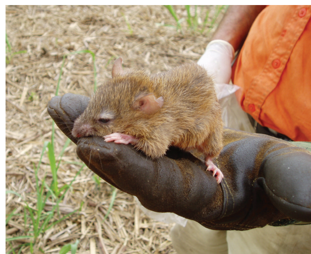
Photo 5 and 6: Climbing rats may be red brown or khaki in colour and are agile climbers.

The climbing rat (photo 5 and 6) is a smaller animal which varies in colour. They measure up to 130 mm in length and weigh up to 80 gm. Back colour varies from grey to red brown. Belly colour is white, grey or cream, sometimes grading to pale orange on the sides. The tail of the climbing rat has a tile pattern as opposed to the series of rings in the case of the ground rat. The climbing rat is an agile climber.