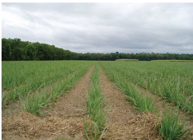
Photo 11: Good weed management is essential to reduce rat populations.

Shoots and seeds of grasses and broadleaf weeds provide rats with high protein levels required to maximise their breeding potential. High levels of protein stimulate female ovulation and help males to maximise their sperm production. Good in-crop weed control (Photo 11) removes this food source and prevents rats from reaching the body condition suitable for sustained, high levels of breeding. Weed management should aim to prevent weed seed set, starting in the fallow and continue through to older ratoons.