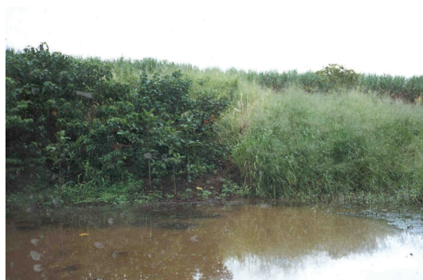
Photo 12: A grassy bank harbourage (on the right) compared to a revegetated section next to it.

Harbourage areas are non-crop areas on your farm where rats shelter when the crop is harvested. Any grassy and weedy patches on your farm are potential harbourage areas for rats (Photo 12). Higher levels of both ground and climbing rat damage are more likely when harbourage areas are in close proximity to cane blocks. The aim of managing harbourage areas is to prevent grasses and weeds from seeding and to make these areas unfavourable to rats. Strategies include slashing, fencing and grazing, and shading out grass and weeds with trees planted at 1.5-2 metre spacing (Photo 12 and 13).