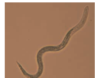
Root knot nematode larvae.