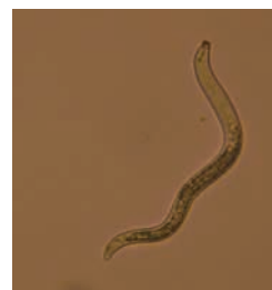
Root lesion nematode larvae.

Stirling G (2008). The impact of farming systems on soil biology and soilborne diseases: examples from the Australian sugar and vegetable industries – the case for better integration of sugarcane and vegetable production and implications for future research. Australasian Plant Pathology , 2008, 37 , 1-18.