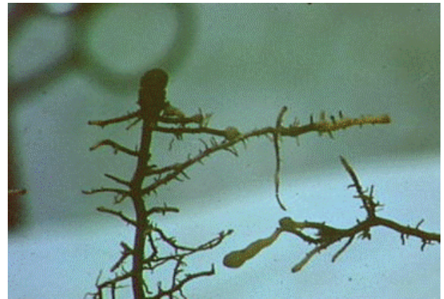
Galls produced by root-knot nematode (above) and lesions produced by lesion nematode (below). The absence of fine roots (above) is the result of several nematode species feeding on roots.

As nematodes are small (most are <1 mm) and transparent they are invisible to the naked eye. Their presence may be detected by symptoms in the crop, or through soil testing.