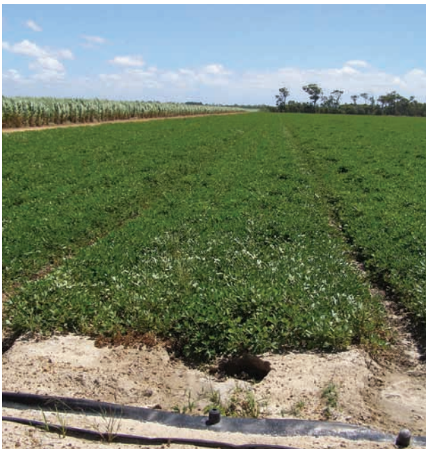
Peanut crop, a good rotation crop for suppressing root knot nematode numbers.

Note: Nematicides are Dangerous Poisons. Always read and follow label safety directions. Products are poisonous if absorbed by skin contact, inhaled or swallowed. Temik 150G® may only be purchased and applied by persons with a Bayer CropScience Certificate of Temik 150G Accreditation . Application must be made through a granule applicator attached to the tractor. Application equipment should be accurately calibrated and be of a type which does not grind the granules. Information on suitable application equipment is available from Bayer CropScience Pty Ltd.