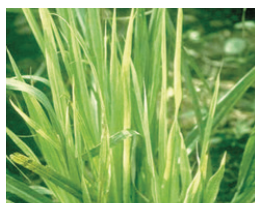
Ramu Stunt – Suspected Virus