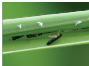
Eumetopina flavipes – Island planthopper