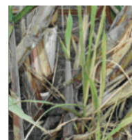
Grassy shoot – Phytoplasma

SRA has research programs aiming at minimising the risk of exotic pests and diseases, and is actively preparing for incursions via developing diagnostic tests and identifying effective control strategies such as biological and chemical control and resistant varieties.