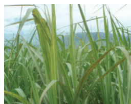
Downy Mildew – Peronosclerospora sp.