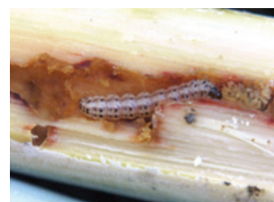
Chilo sacchariphagus – Striped sugarcane borer