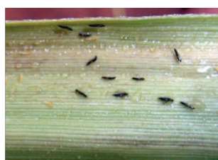
Fulmekiola serrata – Sugarcane thrips