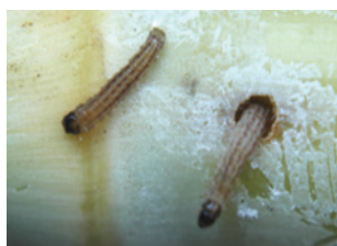
Chilo auricilius – Gold-fringed rice borer