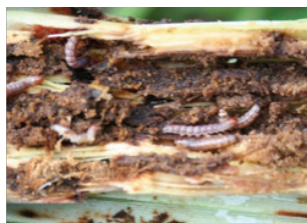
Sesamia grisescens – Ramu shoot borer