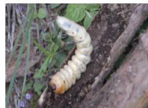
Dorystenes buqueti – Longhorn borer