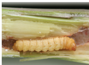
Scirpophaga excerptalis – Sugarcane top borer