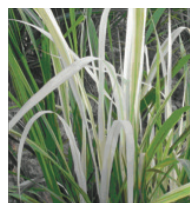
White Leaf – Phytoplasma