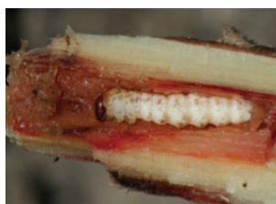
Chilo terrenellus – Stem borer