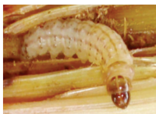
Chilo infuscatellus – Early shoot borer