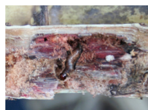
Eldana saccharina – African sugarcane moth borer