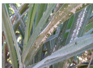
Ceratovacuna lanigera – White Woolly Aphid