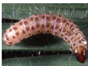
Diatraea saccharalis – Sugarcane borer