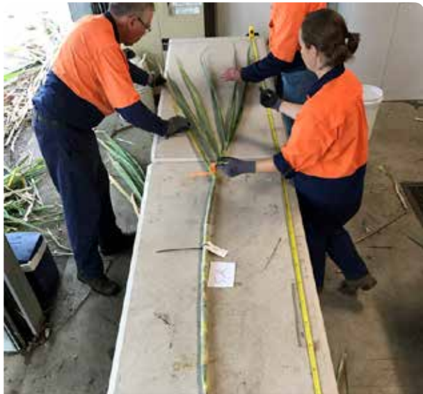
Leaf and stalk measurements.

We recently completed an intensive data gathering and tissue sampling exercise of KQ228 ® stalks from a growth regulator trial in the Burdekin. Some of the data collected involved measuring internode volume, water content, photosynthetic rate and leaf area to name a few. Internode and leaf tissue, together with xylem sap, were snap frozen in liquid nitrogen in the field and returned on dry ice to Brisbane for further processing.