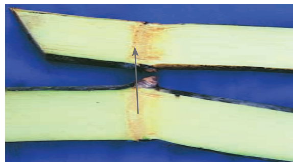
Red dots in nodes of RSD infected stalk (top) compared to a healthy stalk (bottom).