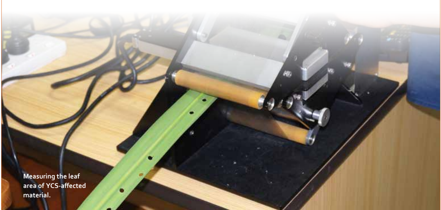
Measuring the leaf area of YCS-affected material.