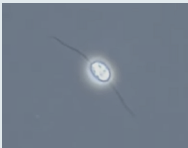
Figure 4: The organism causing chlorotic streak, a Cercozoa with two flagella.

Using new sequencing technologies, they compared the DNA between a healthy sample and infected sample. Their investigations eventually led them to a group of organisms called protozoans. - The organism is a unique Cercozoa, not closely related to any known organism. It has been named as Phytocercomonas venanatanas . The organism is about one hundredth of one millimetre in size and is distinguished by two flagella (whip-like structures; Figure 4).