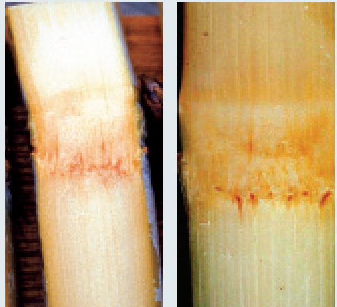
Figure 3: Comparison of internal stalk reddening in chlorotic streak (left) and RSD (right).

If stalks with chlorotic streak are sliced lengthwise, short red streaks will be seen running through the nodes - these streaks are longer than those seen with ratoon stunting disease (Figure 3).