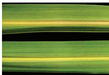
Image 5: Leaves showing symptoms of Yellow Leaf Syndrome. Note the yellow midrib.

Yellow Spot (YS) is caused by a fungus and is usually seen in the wet tropics. It is characterised by: