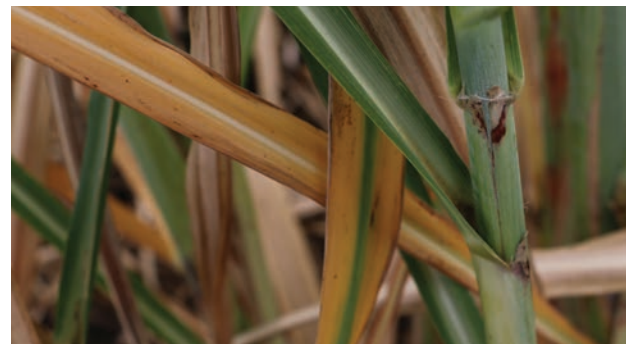
Image 3 and 4: YCS observed in the field near Hervey Bay in March 2016.