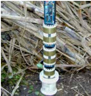
Above: Capacitance Probe.

Capacitance probe deficit figures are not a measurement of actual soil moisture deficits. They only provide a guide of when to irrigate not how much water to apply.